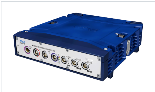
ES886 – ECU and Bus Interface Module

Solution for the validation and calibration of interconnected electronic systems